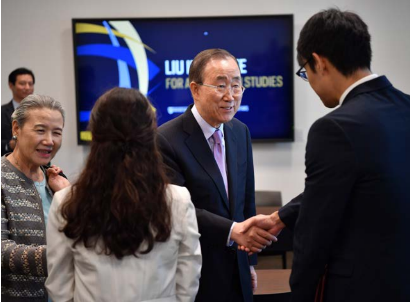
Ban Ki-moon and his wife, Yoo Soon-taek, meet with students before the Asia Leadership Forum.