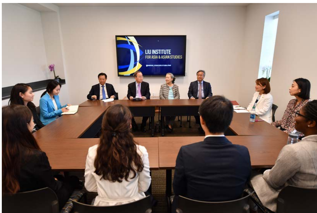
Ban speaks with Korean language and culture students and professors.

During my time serving as United Nations secretary-general, this was one of my most significant achievements. And I truly believe that the Paris Agreement offers us our best hope to persevere